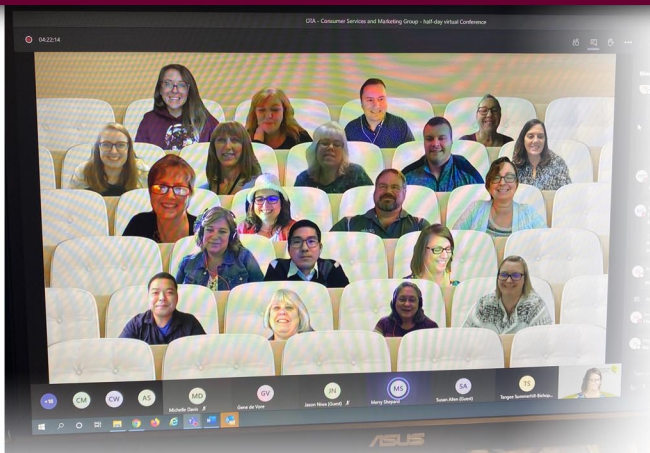
Some of the 'not so camera-shy' attendees participating in the first OTA virtual event!